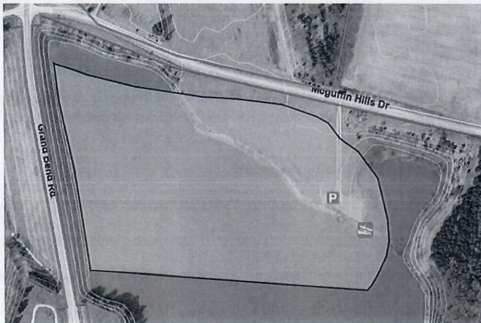
Figure 1: Flying Club Special Use Permit Area